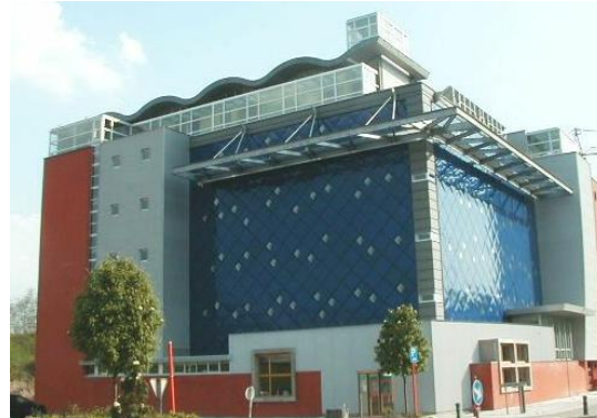
Youth hostel in Malines